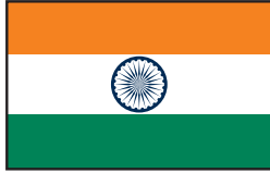
India New Delhi